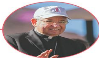
Archbishop José H. Gomez