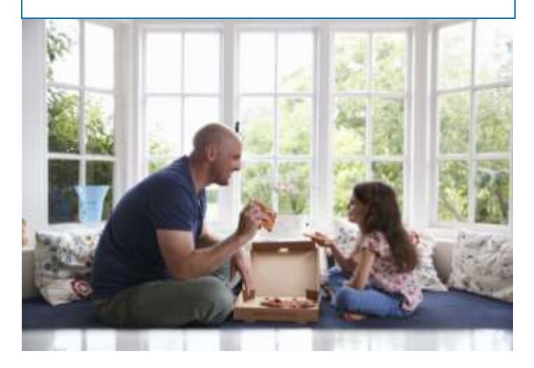
Using the "What If" game to raise problem-solving children

The "What If" game is a great way to walk your children through potential scenarios, and work with them to find the best solutions. Ask your children about "what if" scenarios, mixing silly questions with real world ones to keep them engaged and thinking, like "What if you had super powers?" and "What if a stranger asked you to go somewhere with him at the mall?" You can empower your children with problem-solving skills that will keep them safe even when you can't be there to protect them. For more information, visit d2l.org/what-if-game.