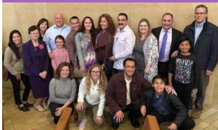
Our Catechumens at the Cathedral for the Rite of Election on March 1. What a joyful day.