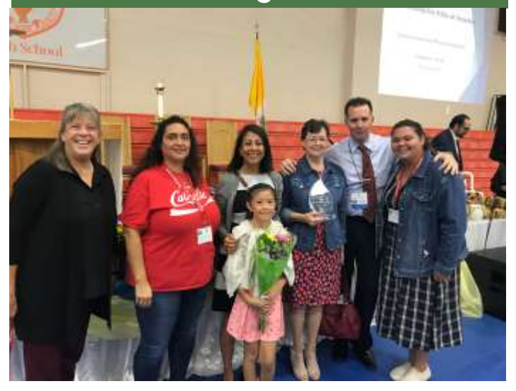
Saint Joseph Parish volunteers & staff at the 2019 San Pedro Regional Congress held on October 5, 2019