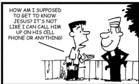
12TH ORDINARY SUNDAY

Life Focus: * Where do you go for seclusion? * If an atheist asked you who Jesus was and why you follow him, what would you say? * Share about someone you know who has "taken up a cross" each day. How does this inspire you? * Which of Jesus' footsteps would you find it impossible to walk in? Why? * In your life, where have you gone or what have you done because of Jesus' lead?