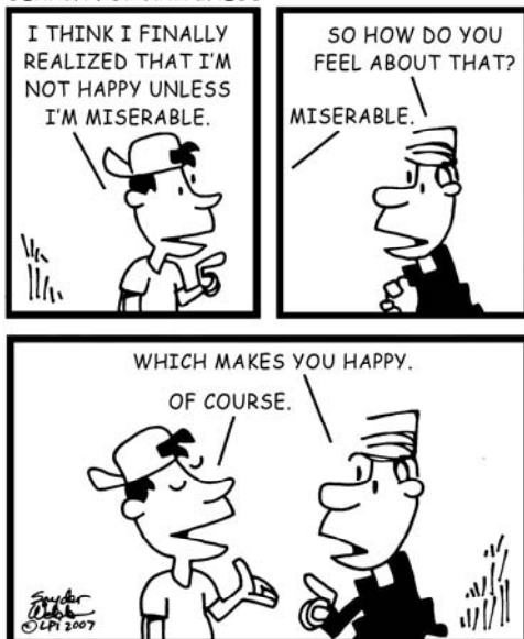
6TH ORDINARY SUNDAY SEARCH FOR HAPPINESS

Life Focus: * Imagine yourself happy. Where are you? Who is with you? What are you doing? What are you feeling? * Speak of an apparent misfortune, "bad luck" or disaster. What was the hidden blessing? * Describe a time in your life when you felt poor or deprived. What impact do the words of Jesus have on these feelings? * What are the things money can't buy? * How can your life be simpler? How can you depend more on God? How can you begin to notice poor people?