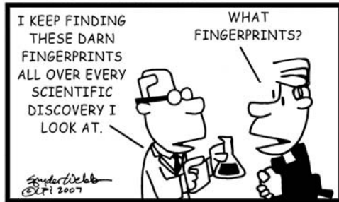
5TH ORDINARY SUNDAY AWARENESS OF GOD'S PRESENCE