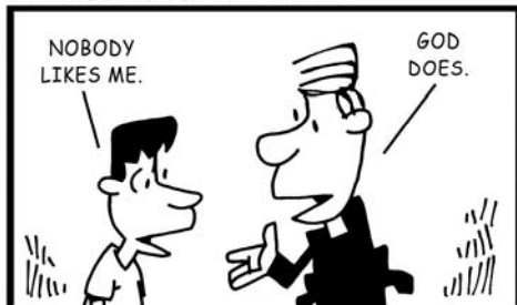
2ND ORDINARY SUNDAY FOR THE LORD DELIGHTS IN YOU