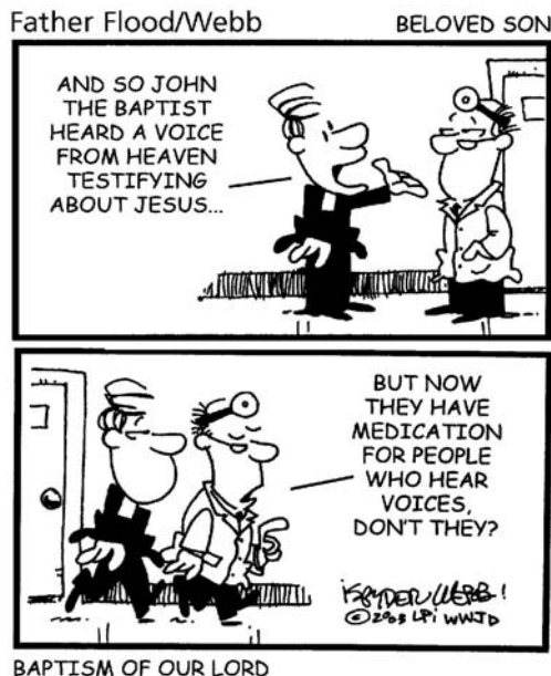
BAPTISM OF OUR LORD

Life Focus: * John the Baptist prepared the way for the Lord. How do you "prepare the way for the Lord" in your own life and in the lives of others? * Baptism prepared Jesus for his mission and life's work. What has your Baptism asked you to do? How have you responded? * Describe a time when you noticed a real renewing of life, either in yourself, in others or in society. What was the effect?