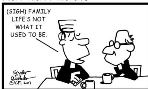
HOLY FAMILY / FAMILY LIFE

Life Focus: * What do you think were the feelings Jesus' parents during the three days they were searching for him? Share a time when you may have had similar feelings about a lost child or a loved one. * Describe a time in your life when you had to let go of a person or a project that had become dear to you. How was your belief in the power of Jesus involved in this letting go? * Every family is a "holy family." In your family situation, what can you do to better recognize the holiness in each member?