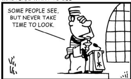
30TH ORDINARY SUNDAY MASTER, I WANT TO SEE

Life Focus: * Describe a time when you were moved to change your way of seeing things because of a very important person in your life. * Give an example of a time in your life when you called out for Christ's help and you found him available. * Think of a time when Christ might have said to you, "Your faith has made you well." * What do you need to see in order to follow God better in your life? * Recall an experience when your values were questioned and you either shouted louder or shut up. * When have you acted on blind faith? *Relate a time when you found Christ approachable.