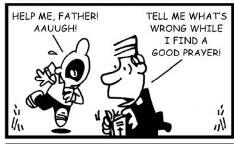
23RD ORDINARY SUNDAY THE HEALING ACTIVITY OF OUR LORD

The inside parking lot will be closed until further notice due to the construction of the handicap bathroom.