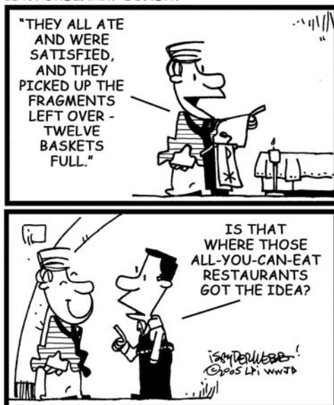
THE MESSIANIC BANQUET