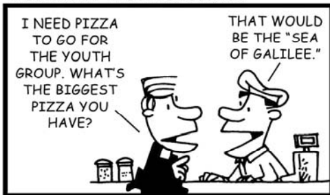
17TH ORDINARY SUNDAY THE HAND OF THE LORD FEEDS US

Life Focus: Relate a time when you were so engrossed in something important that you forgot to eat. * Describe a time when you were surprised that your limited resources were sufficient. * Relate a time when your prayers were answered on God's terms rather than your own. * Share an experience in the recent past in which you recognized a definite sign of the Lord working in your life. * Describe a time when you experienced abundance in your life. * When have you shared your small amount with another? How did this make a difference in the person's life and/or in yours? * Relate a time in your life when you were refreshed by someone. * From your experience, when did you get so caught up in the physical needs - just making a living - that there was no time and energy for anything else?