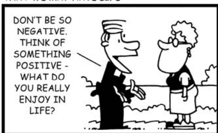
13TH ORDINARY SUNDAY THAT WE MAY HAVE LIFE

Life Focus: * Relate an experience when someone approached you in faith and asked for help. * What are the daily routines that drain you in your faith life? * Describe a time when the storms of life seemed much more real than God's presence.