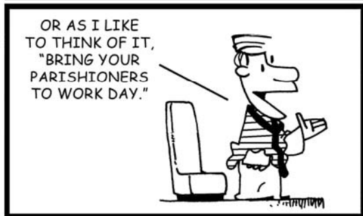
FAITH & FELLOWSHIP