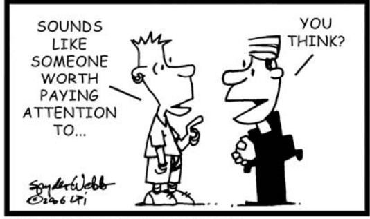
THE LORD HAS INDEED RISEN