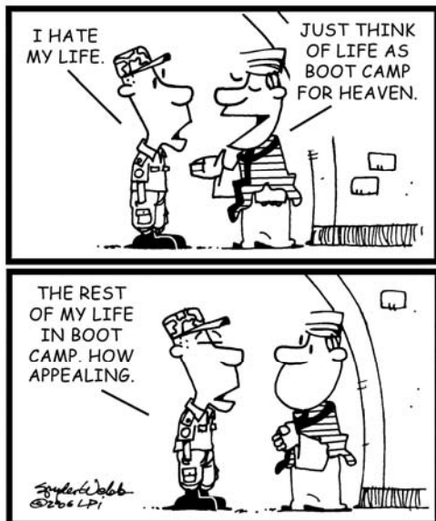
DEATH AS A METAMORPHOSIS