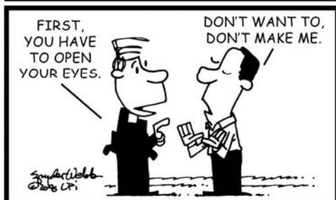
THE SON OF MAN LIFTED UP