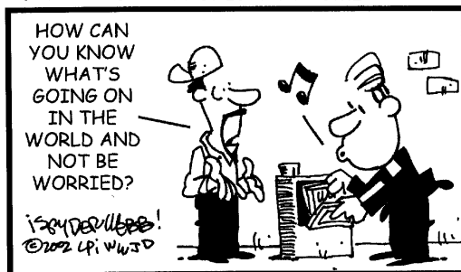
29TH SUNDAY IN ORDINARY TIME