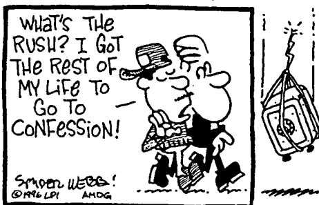
25 TH SUNDAY IN ORDINARY TIME

Life Focus - * Describe a time when you were bothered by generosity shown to someone you thought less deserving. * Tell of an experience when you were treated better than you thought you deserved. * Relate an experience when you were criticized for being generous or forgiving. * Describe a time when you felt cheated by someone else's good fortune. * Where or with whom are you challenged to greater generosity?