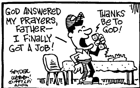
TRIUMPH of the CROSS

Teen: What sacrifices do I make for my friends and family whom I love?