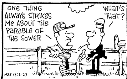
15 th SUNDAY IN ORDINARY TIME

Teen: What can I do in the coming week to make sure that I am open to God in my life?