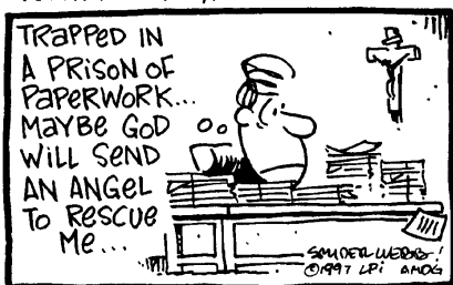
PETER AND PAUL, APOSTLES

QUESTION OF THE WEEK: (Based on today's Bible readings) Adult: How is the Church a gift to me and how am I a gift to the Church? Child: What are some ways I can help others in my family and neighborhood? Teen: How do others see that I know and love Jesus in my life?