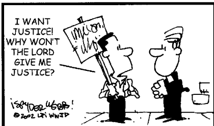
11TH SUNDAY IN ORDINARY TIME