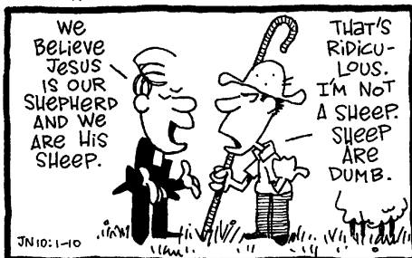
4 th SUNDAY OF EASTER