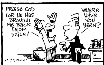
5TH SUNDAY OF LENT

Our parish goal this year is $52,434 . So far, we have had 251 families pledge a total of $49,404 . We are getting close! If you have not pledged your contribution, please do so soon. Complete the pledge card you received by mail (envelopes are also provided in the church and the rectory office), and return it or bring it to church and drop in the collection basket. Thank you for your prayerful consideration and generous response.