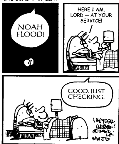
2ND SUNDAY OF LENT

Our Prayer: Oh Lord, You bring us to share Your concern for the good of all. May we work together to build up the earthly city, with our eyes fixed on the city that lasts forever. Healer of body and soul, cure the sickness of our spirit so that we may grow in holiness through Your constant care. We ask this in Jesus' name. Amen.