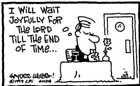
32 SUNDAY OF ADVENT

An easel and table are missing from the church. Whoever borrowed these items, please return them ASAP. The bereavement ministry needs them for funerals. Thank you.