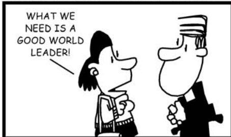
CHRIST THE KING THE GOD-GIVEN LEADERSHIP OF OUR LORD

The Marketplace of Fair Trade Crafts from Concern America, an international development and refugee aid organization based in Santa Ana, will be here on Sunday, December 9 - just in time for Christmas shopping! This year please choose to purchase gifts that will warm the heart of the recipient and promote justice and fair trade for families in Central America and Bangladesh. Through your generosity, many materially poor artisans will be able to earn a just wage, support their families, and keep alive their cultural heritage. What is fair trade?? Fair Trade means that trading partnerships are based on reciprocal benefits and mutual respect; that prices paid to producers reflect the work they do; that national health, safety, and wage laws are enforced; and that products are environmentally sustainable and conserve natural resources. You may view a selection of their crafts on the website: www.concernamerica.org .