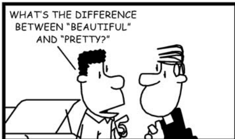
32ND ORDINARY SUNDAY LIVING ON AS BEAUTIFUL PERSONS

-Welcoming the Stranger Among Us: Unity in Diversity, A Statement of the U.S. Catholic Bishops