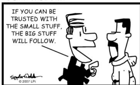
25TH ORDINARY SUNDAY TO EACH ONE'S OWN

- Sixteen Martyrs of Nagasaki, canonized in 1987