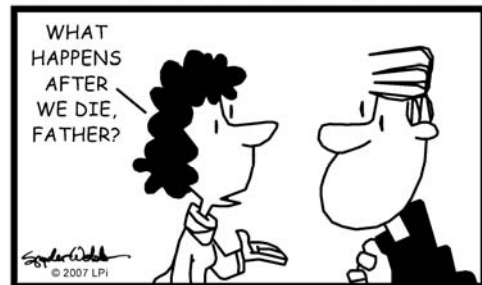
19TH ORDINARY SUNDAY FAITH IN GOD GIVES HOPE FOR A DESTINY TO COME

Our Prayer: Lord, help us to carefully listen to Your Son and set our hearts on what will last forever. Help us to not be fooled by believing that our possessions will bring us happiness that lasts. Help me to grow rich in Your sight and be prepared for Your return. Amen.