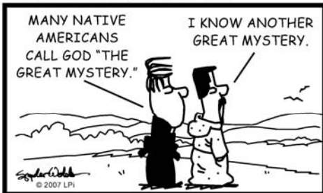
TRINITY SUNDAY THE INEFFABLE MYSTERY OF GOD

Hall Closed - July 3-15 for painting, and August 7-19 for floor work.