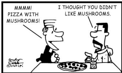
5TH SUNDAY OF EASTER CHRISTIAN JOY TEMPERED BY TRIALS

Our Prayer: God our Father, creator and ruler of the universe, You chose Joseph to care for Your Son in childhood and youth. Teach us to care for Christ's body by caring for our brothers and sisters. With St. Joseph as our example and guide, help us to do the work You have asked and come to the rewards You have promised. We ask this through Jesus, Your Son, who lives and reigns with You and the Holy Spirit, one God, forever and ever. Amen.