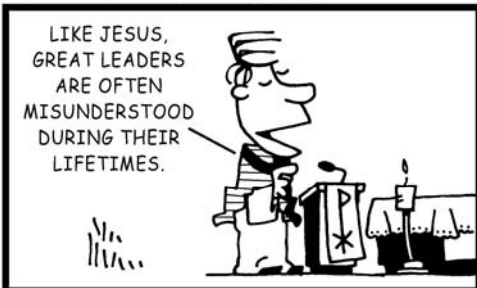
PALM SUNDAY / DEATH AND LIFE