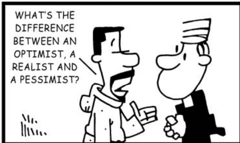
5TH SUNDAY OF LENT RACING TO GRASP THE PRIZE

Since the bishop is the only minister in the diocese who may consecrate chrim, this Mass highlights his ministry and our union with him. He will not baptize and confirm everyone in the parishes of the diocese, but he will be symbolically present in the chrim which the priests and deacons will use. In recent years, this Mass has also acknowledged the ministry of priests. It invites priests to renew their commitment of service and to receive the prayers and support of the people. The Mass of Chrism gathers the faithful of the diocese at their mother church with their shepherd to prepare for celebrations of Christ in all our churches throughout the year.