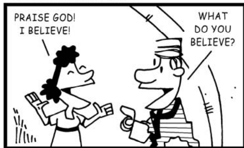
1ST SUNDAY OF LENT THE PROFESSION OF FAITH

A new Ministry Formation Course will be starting on Thursday, March 8 , at St. Cornelius Church . This series of various topics including Images of God, Morality, Scripture, and Revelation will continue on Thursday evenings from 7 pm to 10 pm through June 7 . This course fulfills the Theological Phase towards certification as a Catechist, however, it also may be taken for personal enrichment. Please contact the Religious Education Office at 598-0519 for further information.