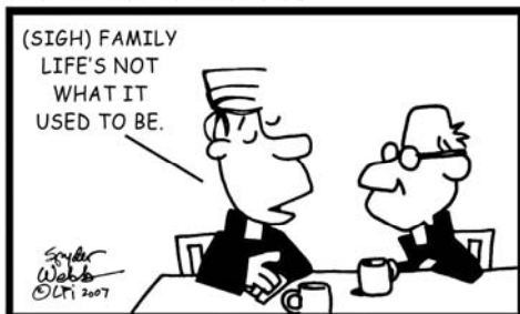
HOLY FAMILY / FAMILY LIFE

LECTORS: Please come to the rectory to pick up your new Lector Workbook as soon as possible.